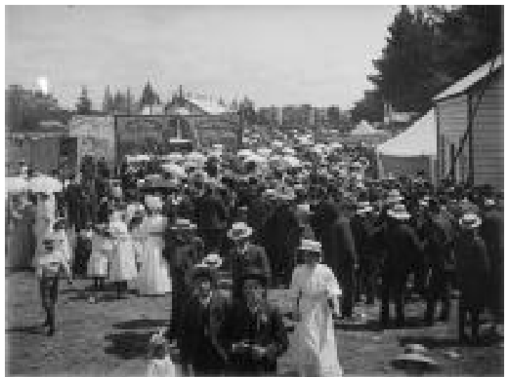
A & P Show, Richmond

This is an opportunity for potential contributors to the website. Take the story on Early Richmond ( http://www.theprow.org.nz/early-richmond/ ). The objective