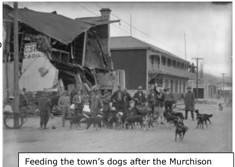
Feeding the town's dogs after the Murchison Earthquake.

Please pass this newsletter on to anybody you think may be interested in www.theprow.org.nz . If this has been passed on to you and you would like to be on our database, or if you wish to be removed from our database, email info@theprow.org.nz